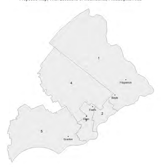
Proposed Map, With Locations of Incumbents, Philadelphia Area